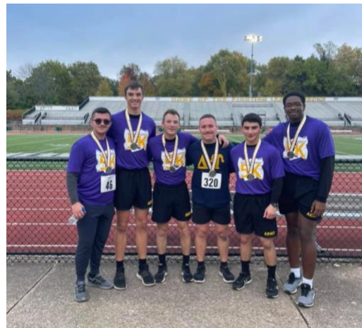
Members either ran the course or helped with placing U.S. flags around the campus.