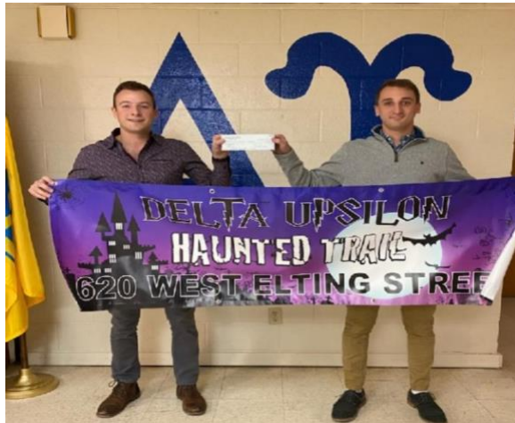
Fall 2021 members raised over $2,600.00 during the annual Haunted Trail event. Almost doubling the amount raised Fall of 2020. Funds are donated to the Delta Upsilon's philanthropy Global Service Initiative