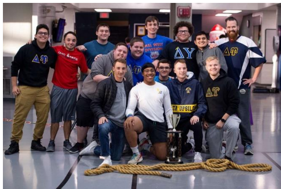
Chapter members took first place in the annual tug of war competition.