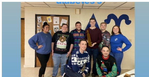
Captured first place in the annual Dodgeball for Diabetes.