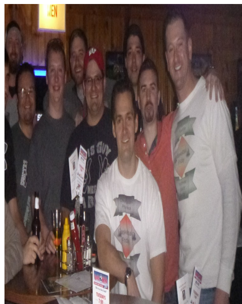
Basketball Friday, Spring 2015