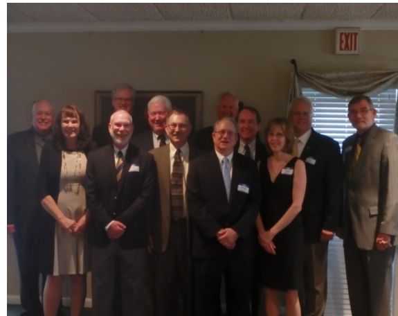
Charter Members attending 40th Anniversary Celebration

Our plan for the future in simple terms is to raise $40,000 for the 40 th .